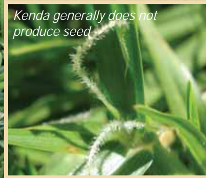
Kenda generally does not produce seed