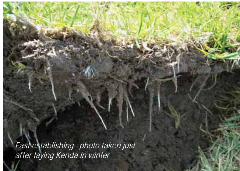
Fast establishing - photo taken just after laying Kenda in winter

* As seeded Kikuyu is all over Australia now, it is possible for an occasional plant of common Kikuyu to blow in from seed, also we have not ruled out the fact that conditions may someday be right for Kenda to produce the occasional viable seed. We have procedures in place to minimize this as much as possible, including turf farm inspections, elite isolated planting stock for farm establishment and future replanting. However, a small level of contamination may be unstoppable. Kenda's unique growth habit makes it harder for seeded Kikuyu to invade it compared to other Kikuyu types.